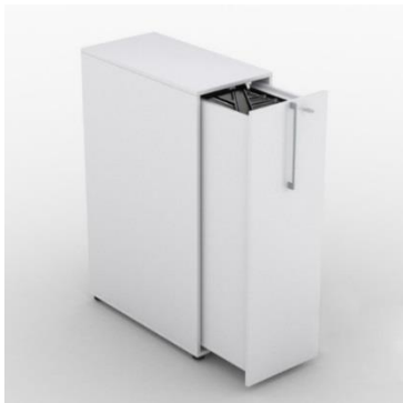
800x400, H=1200 DNE316