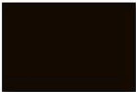
Dark grey (N1)