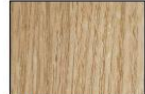
Whitened Oak (D1)