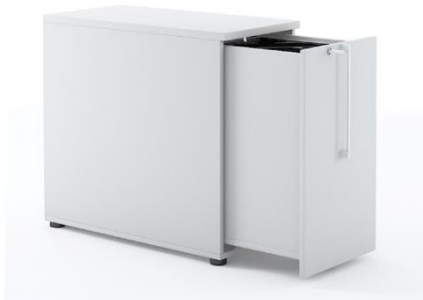
800x402, H=741 DNE218