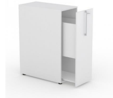
800x400, H=1090 DNE314