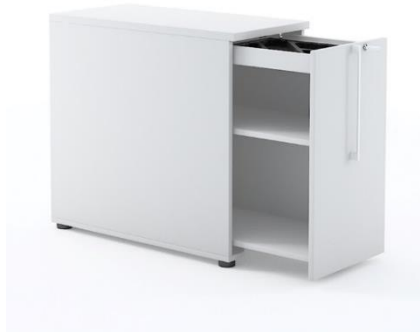
800x402, H=741 DNE217