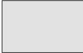
Light grey (N)