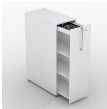
800x400, H=1200 DNE315