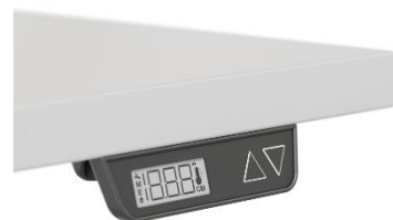
VA button with screen, up and down drive and 2 memory positions