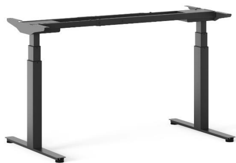
Electrically adjustable legs (3-level columns)