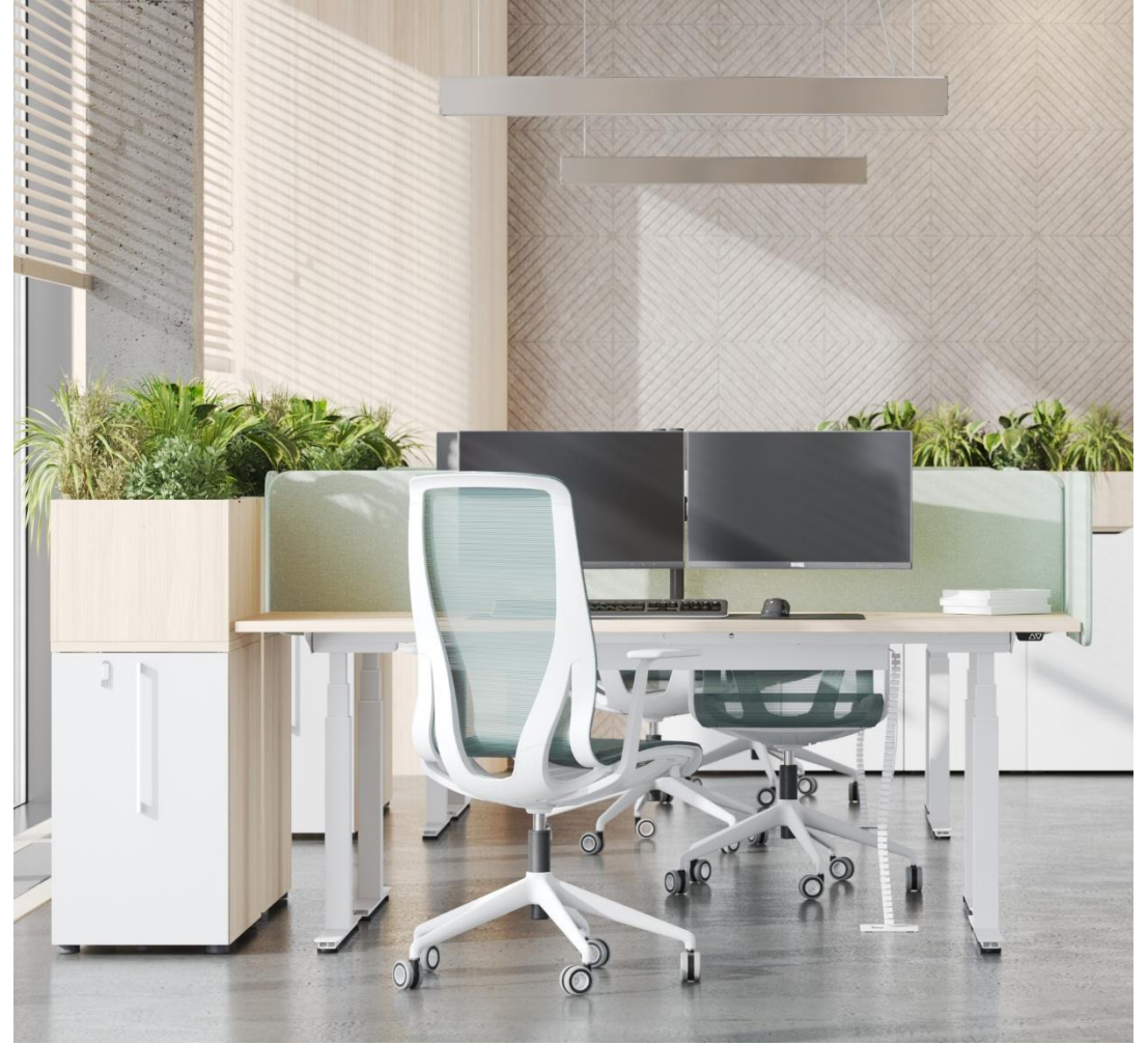
For spacious workplaces