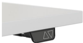
UA button with up and down drive and 2 memory positions