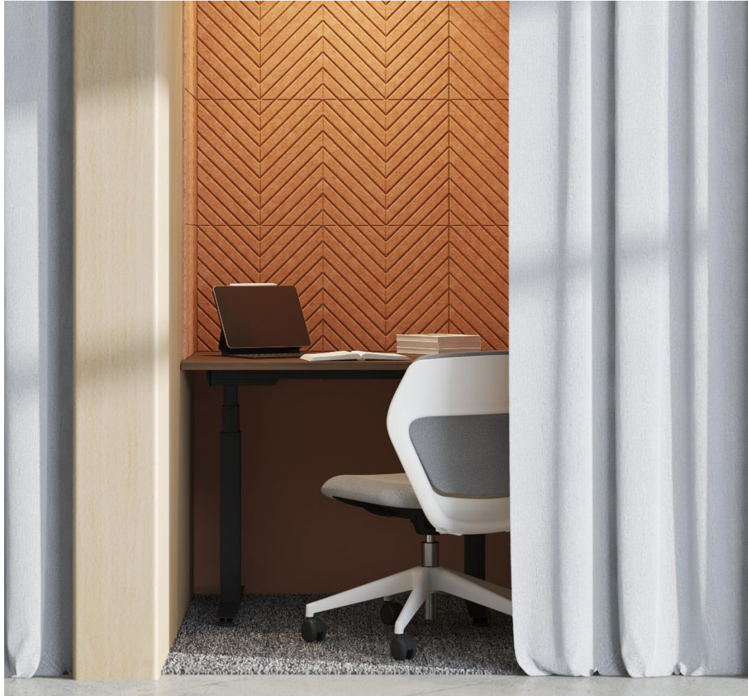
For small, individual workplaces or short-term work