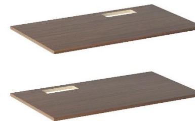
Desktop length: 1200 / 1400 / 1600 / 1800* / 2000* mm Desktop width: 700 / 800

* only available with 800 mm desktop width