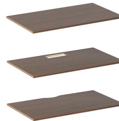
Desktop length: 1000 / 1200 / 1400 / 1600 / 1800* / 2000* mm Desktop width: 700 / 800