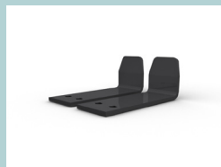
Linking parts (2 pcs.)