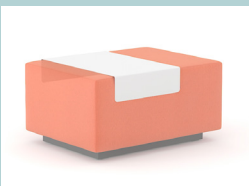
Metal table placed on the pouf (black or white colour)