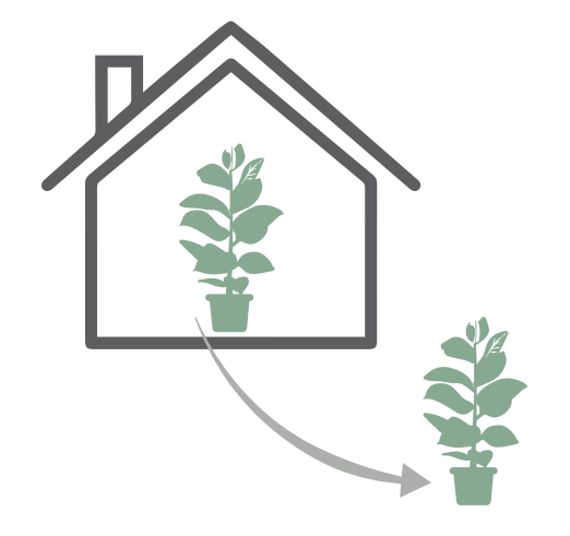
1. Remove (if possible) the plants from their position, and store them in a open and ventilated area.

If for some reasons the plants collect an excessive amount of dust, or if the regular cleaning process is not carried out for too long, some deep cleaning may be needed. We recommend following these steps: