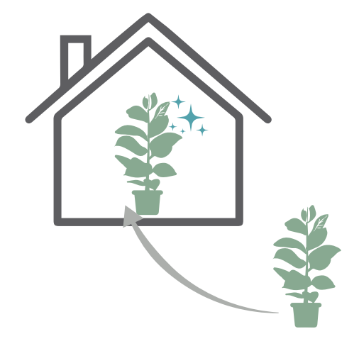
3. Adjust the canopy shape after cleaning, and bring the plants back to their usual location.

If it's impossible to remove plants and greeneries from their place, or if the plant is too large to be moved, we suggest wiping carefully every leaf or flower with a moist rag, using a gentle cleaning product if needed.