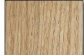
Whitened Oak (D1)